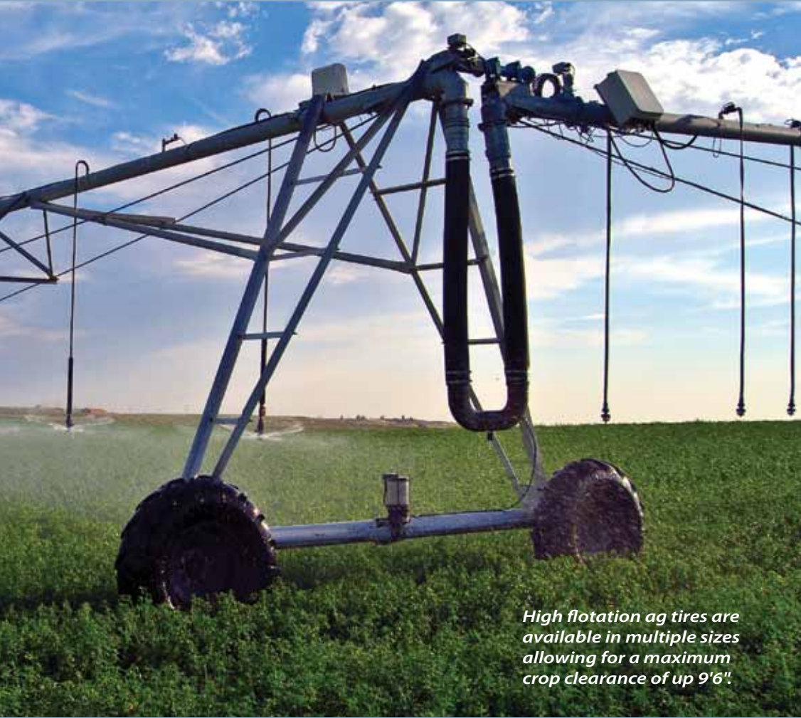
High flotation ag tires are available in multiple sizes allowing for a maximum crop clearance of up 9'6".